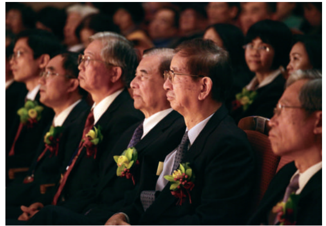
李遠哲 先生 東元獎科技類 頒獎人 中央研究院 榮譽院長